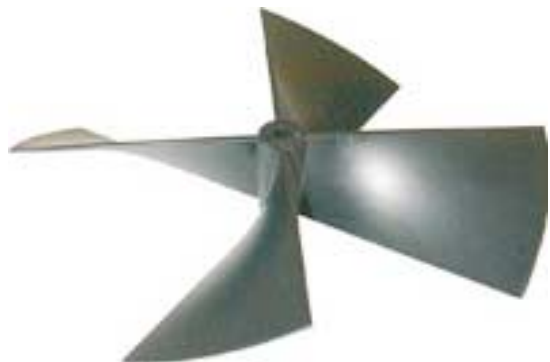
WS-08234 - Propeller