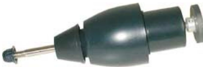
WS-05162 - Complete nose cone and propeller shaft assembly including O-ring

Please contact your supplier for details of other replacement parts as required.