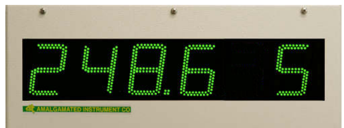
100mm green display version