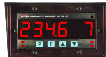
38mm display version