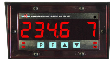
38mm display version