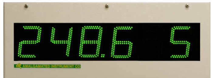
100mm green display version